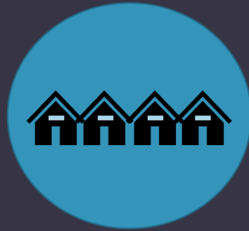
Street with Multiple Businesses