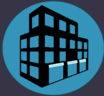
Building with Multiple Tenants