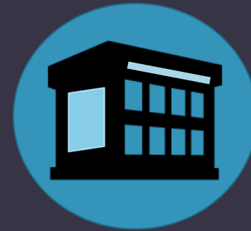
Project with Multiple Signs